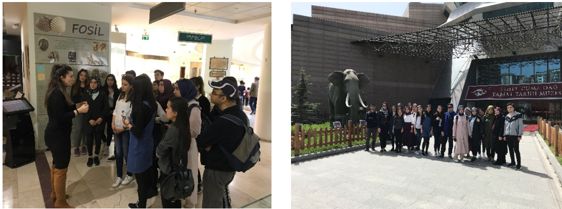
Figure 2. Photos from the museum visit