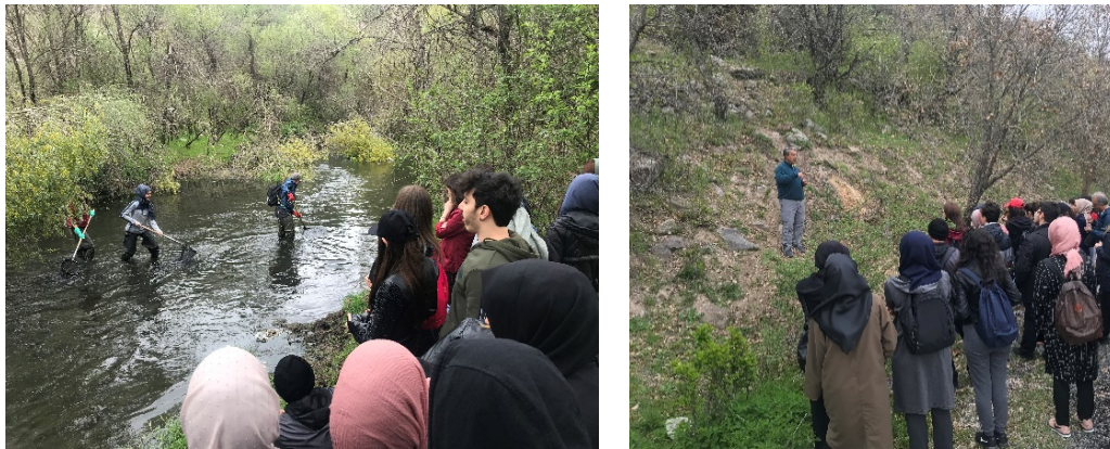
Figure 3. Photos from the scientific field trip